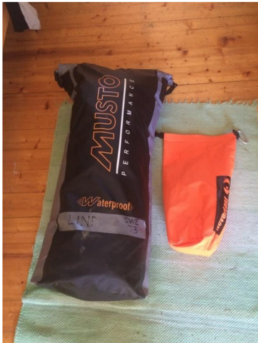
Figure 1: Waterproof bag <10 kg (30 L) and small onboard bag for first aid, VHF etc.

Each sailor is allowed to bring one bag of maximum 10 kg (typically 30 - 45L) to the assisting boats. The bag shall be waterproof meaning it can be submerged under the water for at least 10 minutes without leakage.