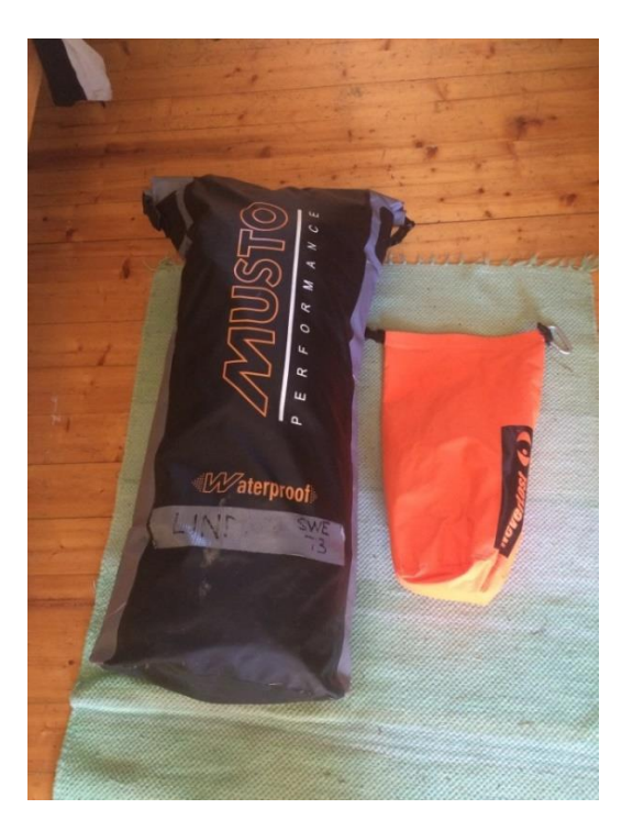
Figure 1: Waterproof bag <10 kg (30 L) and small onboard bag for first aid, VHF etc.

Each sailor is allowed to bring one bag of maximum 10 kg (typically 30 - 45L) to the assisting boats. The bag shall be waterproof meaning it can be submerged under the water for at least 10 minutes without leakage.