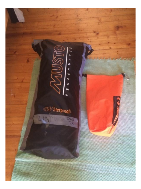
Figure 1 Waterproof bag 45 L and small onboard bag for first aid, VHF etc.

The bag shall be waterproof and contain the sheets, clothes and other necessary equipment. The space onboard the motor boats are very limited and larger bags will be refused.