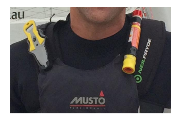
Figur 1 Example of knife and flare on life west

1 knife attached to boom and 1 on the Dolphin striker.