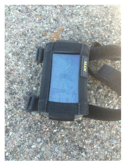
Figure 3 Garmin Montana with custom made wrist strap.

Others use an iPad in a waterproof pocket, but they sometimes have problems with reading fingers in wet conditions and/or battery not lasting long enough.