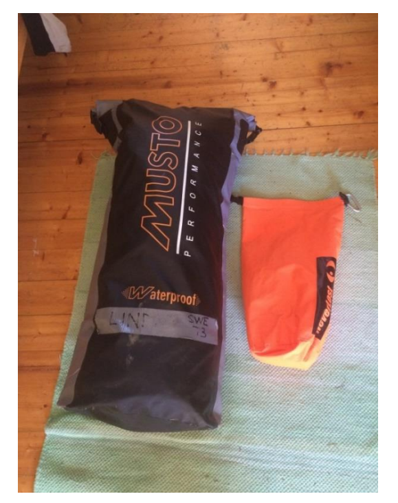
Figure 1 Waterproof bag 30L and small onboard bag for first aid, VHF etc.

The bag shall be waterproof and contain the sheets, clothes and other necessary equipment. The space onboard the motor boats are very limited and larger bags will be refused.